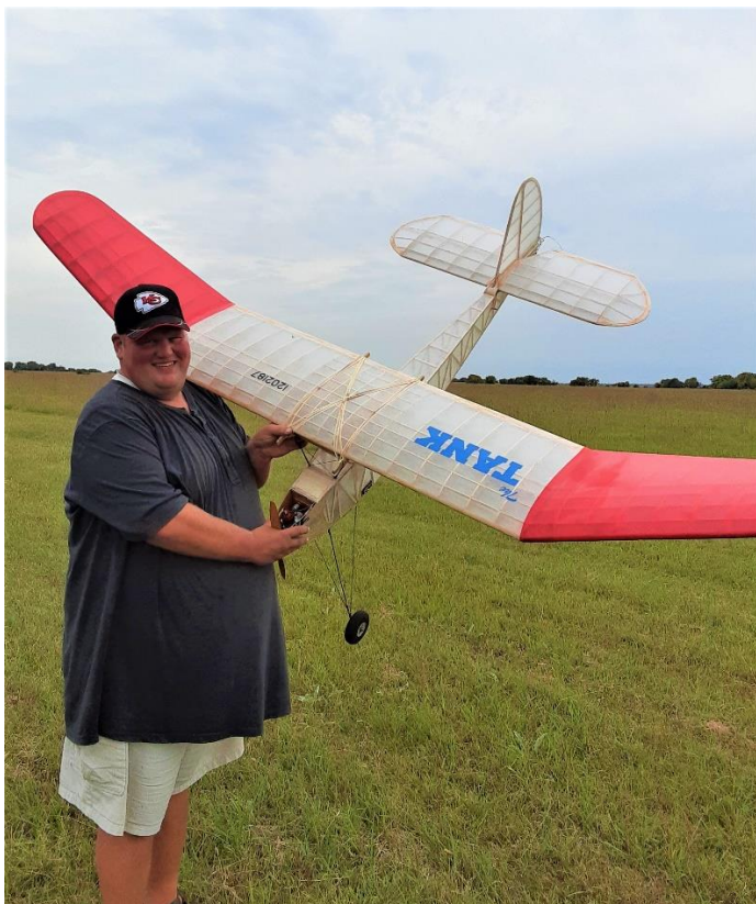
A really big bird!