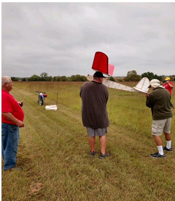
Getting the big bird ready to fly.