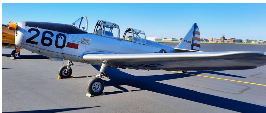
PT-22 – New acquisition at New Century Airport, site of the CAF