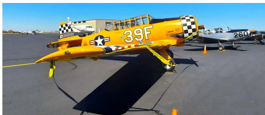
AT-6 "Texan" at New Century